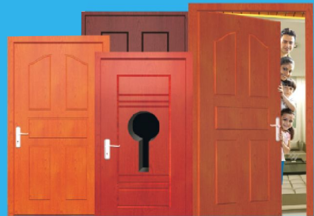
Embossed Wood Finish

Tata Steel's history of offering innovative product solutions at affordable prices now has a new chapter with the introduction of 'Pravesh Doors' - steel doors that have the elegance of wood. This latest addition to the Company's brand portfolio is yet another endeavour to provide value-added steel solutions to individual house builders in semi-urban and rural markets.